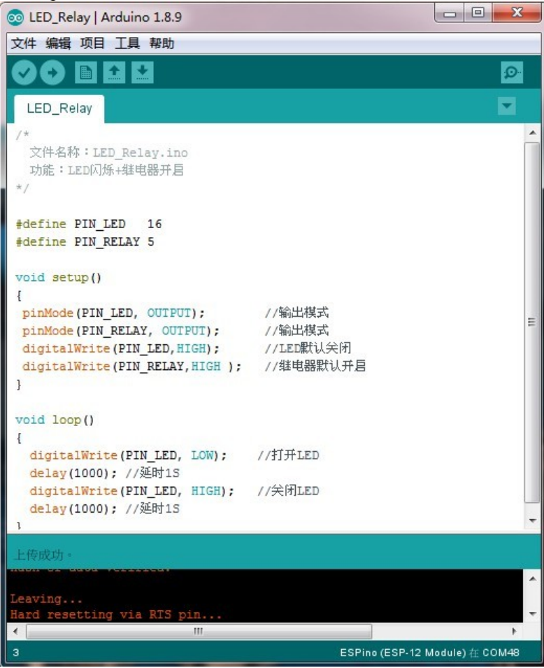
5. Finally, disconnect IO0 and GND, power on the development board again or press the reset button to run the program.

4. After clicking "Upload", the program will be automatically compiled and downloaded to the development board, as follows: